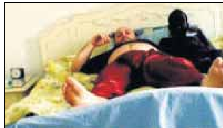
SO SICK: Podgy paedo films himself in bed with a child victim

COPS last night appealed for News of the World readers to name and shame this vile, bloated paedophile, caught on video sprawled over a bed beside his child victim. It's from a series of films he posted on the internet, showing him abusing boys as young as six. As Scotland Yard launched a global manhunt a spokesman told us: "He's white, about 40, of large build and speaks with a northern accent, possibly Manchester. "He's thought to have visited Egypt, Malaysia and Italy, with current strong links to Dubai." Call the Yard on 0207 161 2780 or Crimestoppers on 0800 555 111.