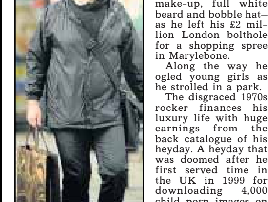
SHOPPED! Glitter on spree

Along the way he ogled young girls as he strolled in a park. The disgraced 1970s rocker finances his luxury life with huge earnings from the back catalogue of his heyday. A heyday that was doomed after he first served time in the UK in 1999 for downloading 4,000 child porn images on to his computer.